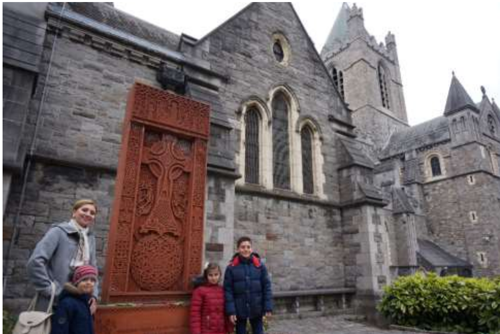
The memorials of the Armenian Genocide in Dublin and Yerevan